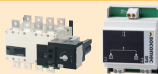
ATyS r Transfer Switching Equipment