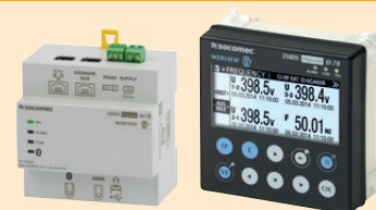
DIRIS Digiware M-70 & D-70