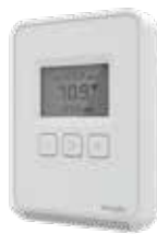
LCD with Buttons