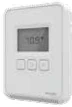
LCD with Buttons