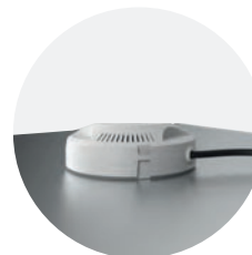
Panel Pod Emergency installed