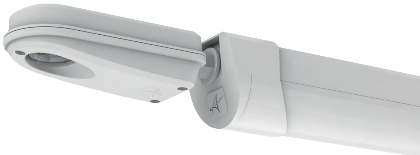
Installed on ATLEVO4