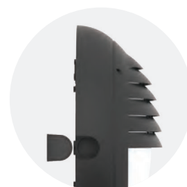
Removable conduit entry cap for ease of installation