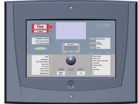
FX101 control panel

The panel is compatible with other fire detection equipment, such as the fireman's panel FMP2, zone led panel ZLPX, alarm delay panel DAP2, communication protocol repeater REPX and logic control unit MCOX, as well as alarm management system ESGRAF. The system also provides an interface to the building management system.