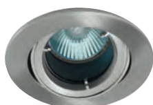
ATL/BA fitted into Twistlock Low glare baffle adaptor