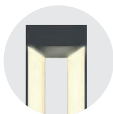
Hollow design provides ultra-modern appearance