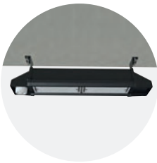
Suitable for surface mounting