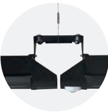
Linkable connector for continuous mounting