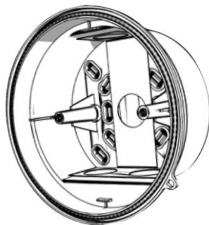
Deep Base BPW-E010 (IP44)