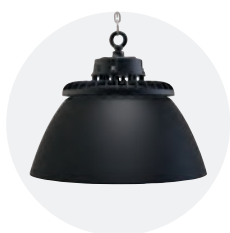
AZLEDPLUS/REF - Aluminium Reflector