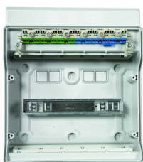
Integrated plug-in terminal technology for PE and N conductors.