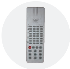
AZLED/MWSP - Microwave Sensor Programmer