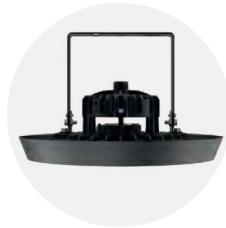
AZPELED/FB1 - Mounting Bracket Accessory