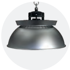
AZPELED/REF - Aluminium Reflector