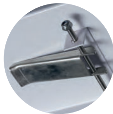
Easy Fix style bracket