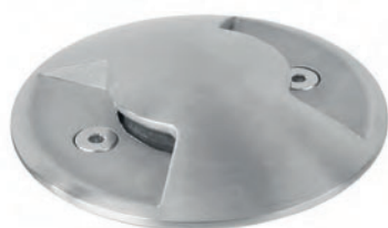
2-way Mini drive over cover