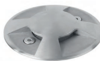
4-way Mini drive over cover